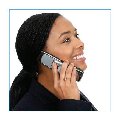
U.S. Research Summary March 2008

AND FOUR REASONS WHY IT'S DIFFICULT TO STAY OFF THE GRID